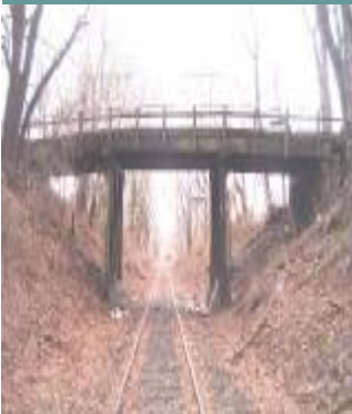
The "Old" Sunnyside Road Bridge will soon be history

Within the next month, bid packets will be going out for the long awaited replacement of the Sunnyside Road Bridge.